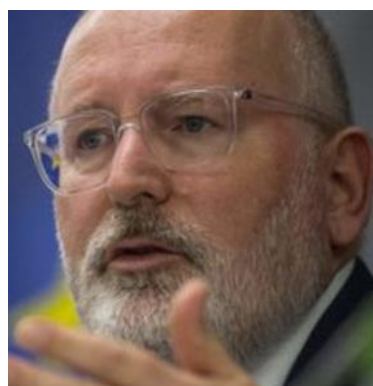
Commission Vice-president Frans Timmermans