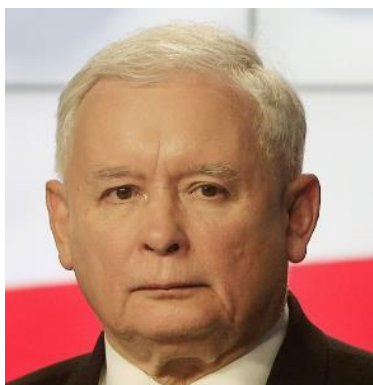
Party chairman (PiS) Jarosław Kaczyński